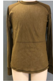
Mesh Base Layer