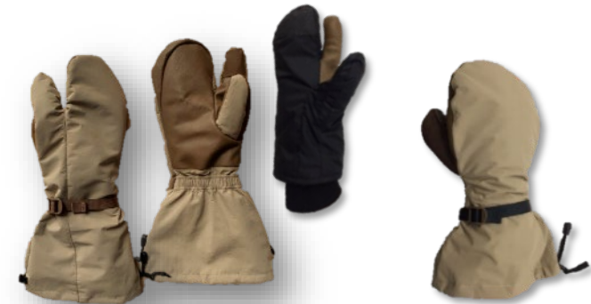
Trigger Finger Mitten