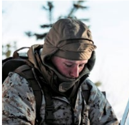
Cold Weather Cap