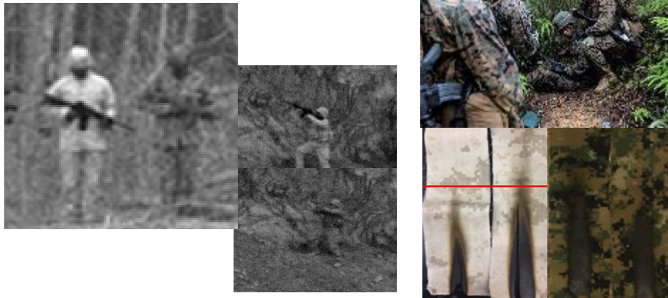
Baseline Technologies: FR Finish Application & Proof-of-Concept SWIR developmental materials & tropical fabric.